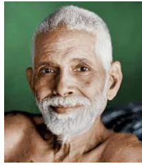
Bhagavan Sri Ramana Maharshi