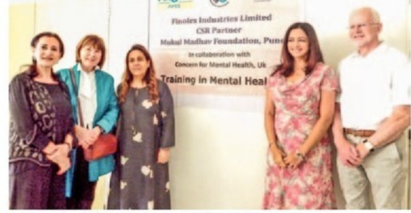
मानसिक आरोग्य शिबिरासाठी उपस्थित मार्गदर्शक व संयोजक.