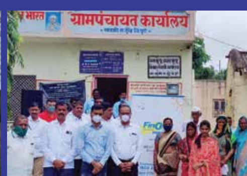
Lighting up Futures Read more about the Khadki Illumination project on page 3