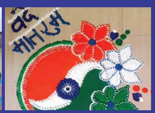
Celebrating the Country To read more about Independence Day celebration at Mukul Madhav Vidyalaya scroll to page 4